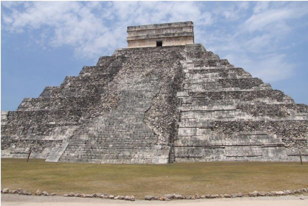
Temple of Kukulcan at Chichen Itza